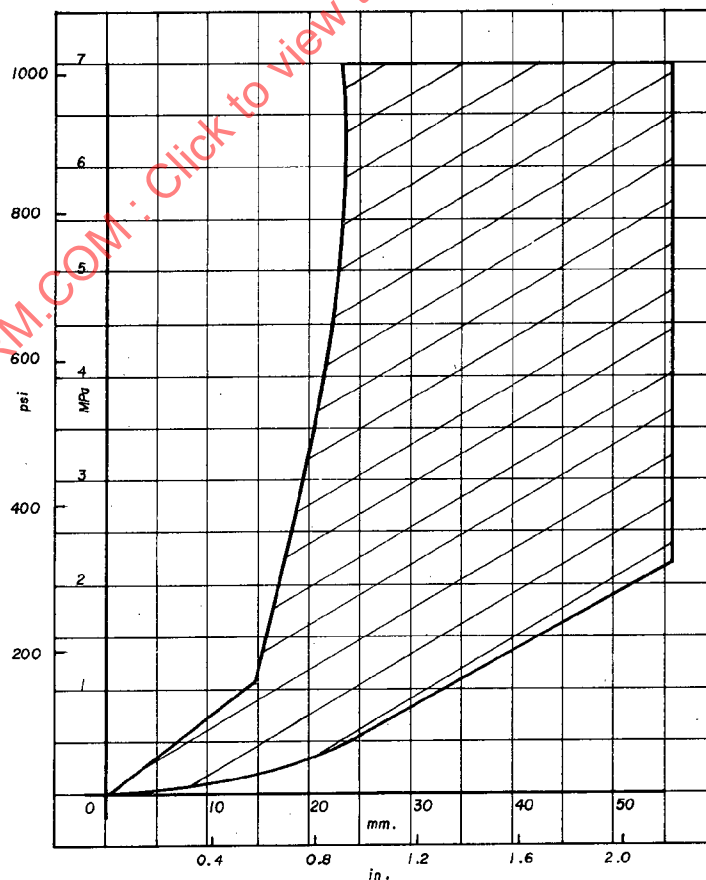
FIG. 3 - TYPICAL MASTER CYLINDER CUP STROKE VERSUS PRESSURE 15 TO 51 MM (5/8 TO 2 IN) DIAMETER